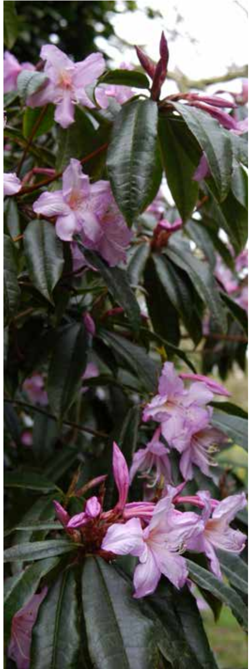
MAGNOLIA MOULMAINENSE (AS STENAUUM)