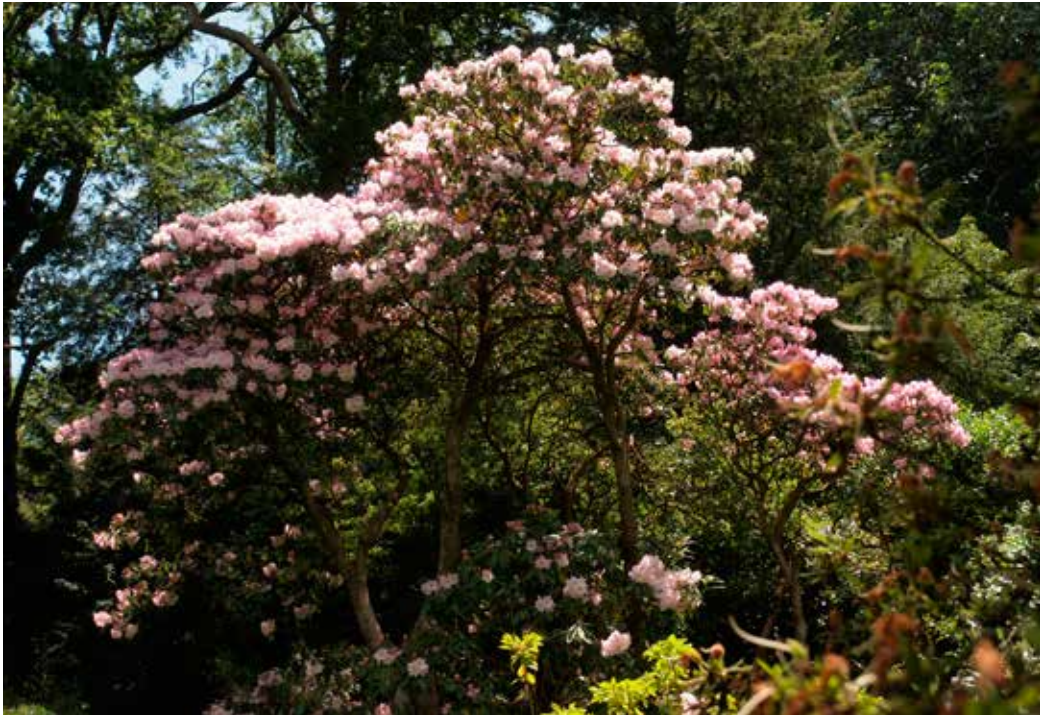
RHODODENDRON DECORUM PINK FORM