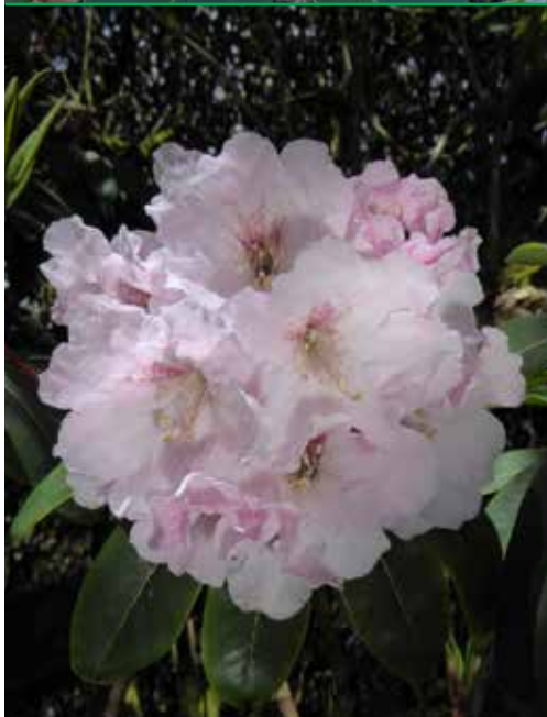
WERRINGTON CENTENARIAN SPECIES RHODODENDRON LACTEUM (TOP) RHODODENDRON VERNICOSUM (BOTTOM)