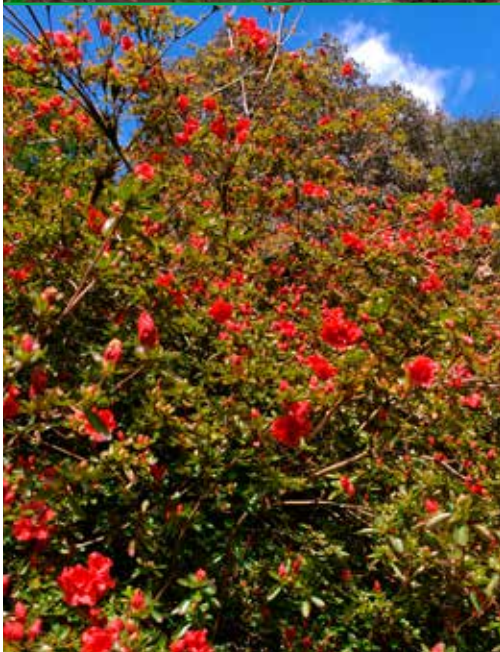
THRIVING CENTENARIANS R. MADDENII SSP. CRASSUM regenerating well (TOP) R. KAEMPFERI flowering profusely after being cut back hard (BOTTOM)