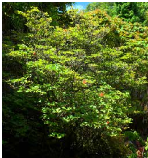
RHODODENDRON WEYRICHII still magnificent after nearly a century CAERHAYS ESTATE

One might therefore have expected greater longevity in many species. This is borne out by the survival, for instance, of Rhododendron lacteum or R. williamsianum at Werrington but not at Caerhays. On considering the list more closely, it is obvious that the larger leaved rhododendrons have survived the century far better at Werrington than at Caerhays. Nevertheless, there are only four centenarian species which appear on both lists.