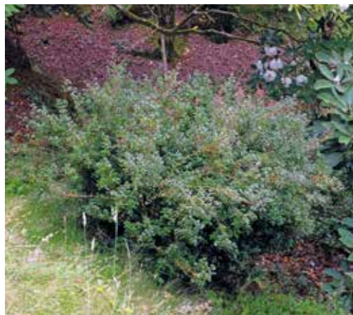
RHODODENDRON OVATUM has been cut back to reshoot several times over the past century CAERHAYS ESTATE

With the help of Mary Ashworth, curator at Werrington Park, a review of the centenarians still surviving there and flowering today has been undertaken. At the time when the Forrest and Wilson introductions were arriving, J C Williams owned and created gardens at both Caerhays and Werrington. The Chinese Garden at Werrington on the Devon/Cornwall border near Launceston is, however, very different climatically to Caerhays. The garden faces north and is near the top of a hill with many more days of exposure to cold winds, frost, and it has 15 to 20 inches less rainfall annually.