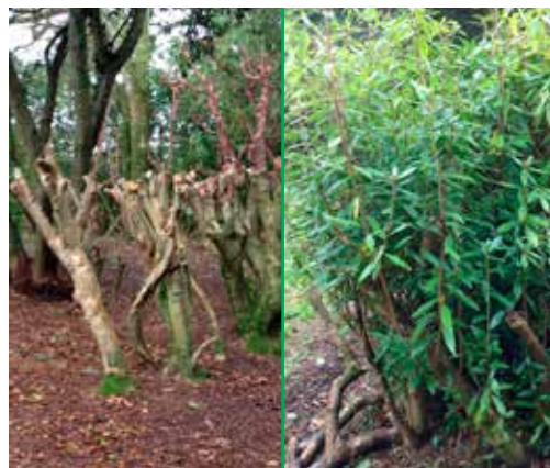
RHODODENDRON AUGUSTINII is 'rejuvenated' by regular hard pruning