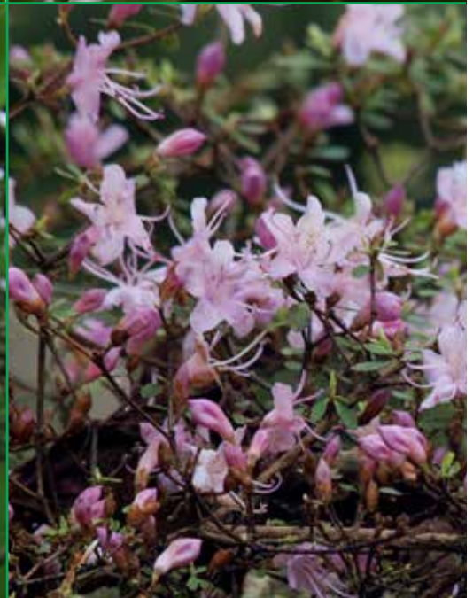
RHODODENDRON INDICUM (TOP LEFT) RHODODENDRON HANCEANUM tall form (TOP RIGHT) RHODODENDRON SCHLIPPENBACHII (BOTTOM LEFT) RHODODENDRON SERPYLLIFOLIUM (BOTTOM RIGHT)