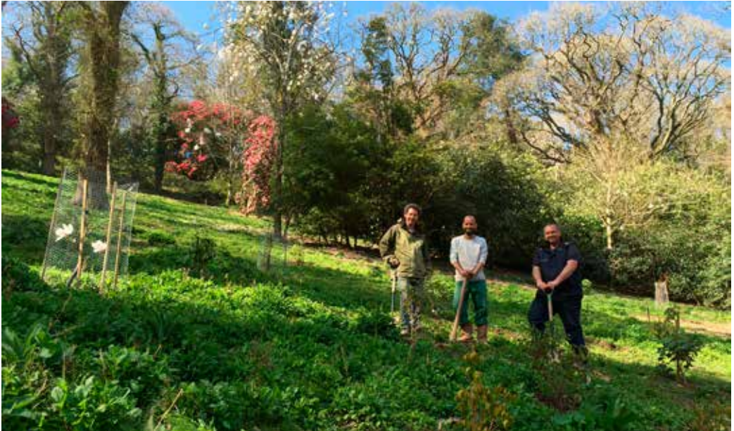
NEW PLANTING IN PROGRESS IN OLD PARK