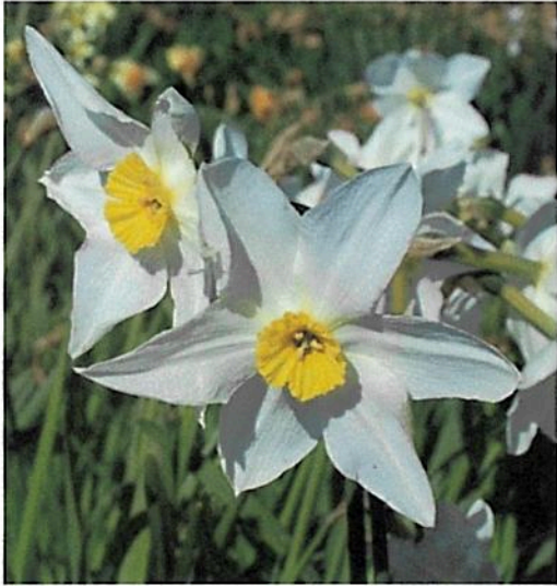
Croft 16 stock 01.035 ex Cotehele orchard